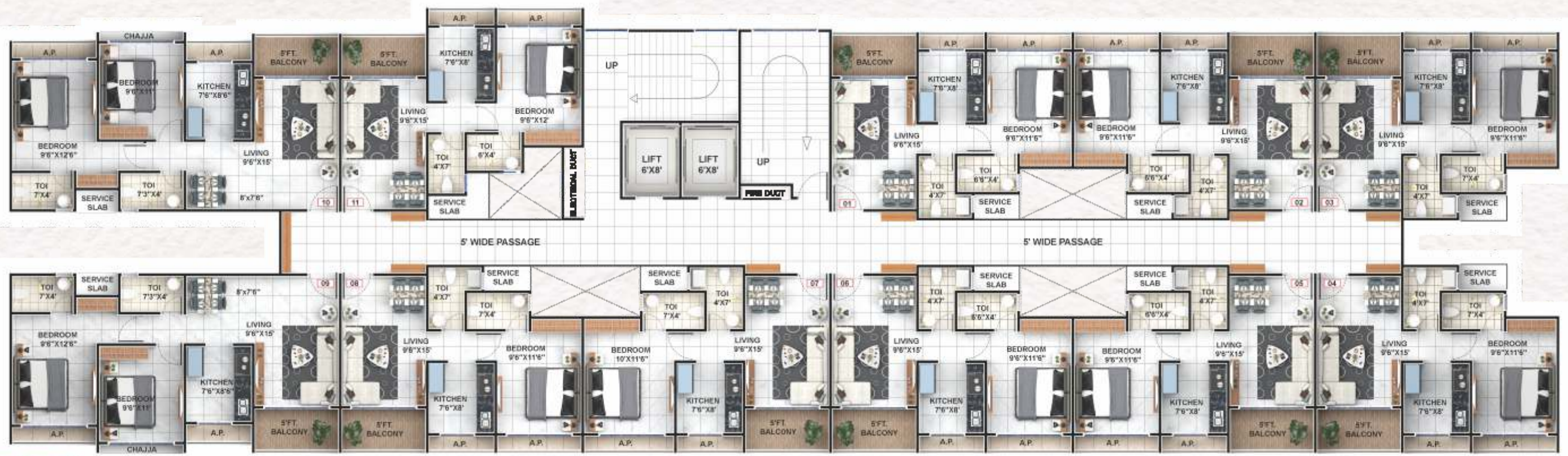
3,5,7,9,11,13 FLOOR PLAN