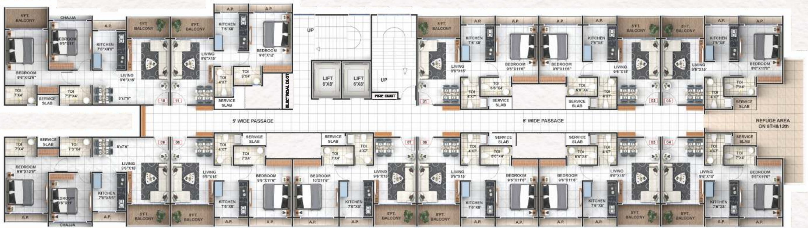
2,4,6,8,10,12 FLOOR PLAN